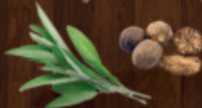
Sage & Nutmeg