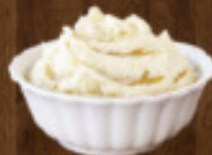
Mashed Potatoes (without the butter & foan's)