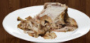
Turkey Bones & Skin