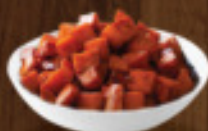
Plain Yams & Sweet Potatoes