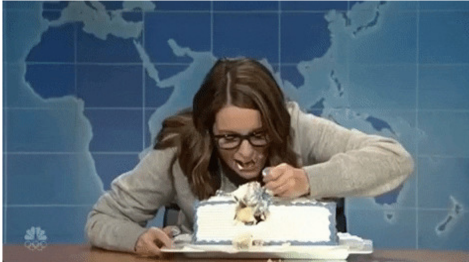
Not an actual image of Julie's Cheesecake